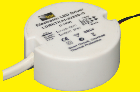
Flying Leads In/Out